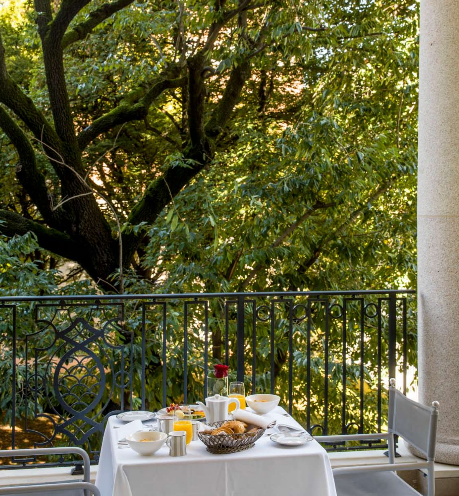
ABOVE: breakfast is served on the terrace overlooking the large inner garden characterized by secular trees.