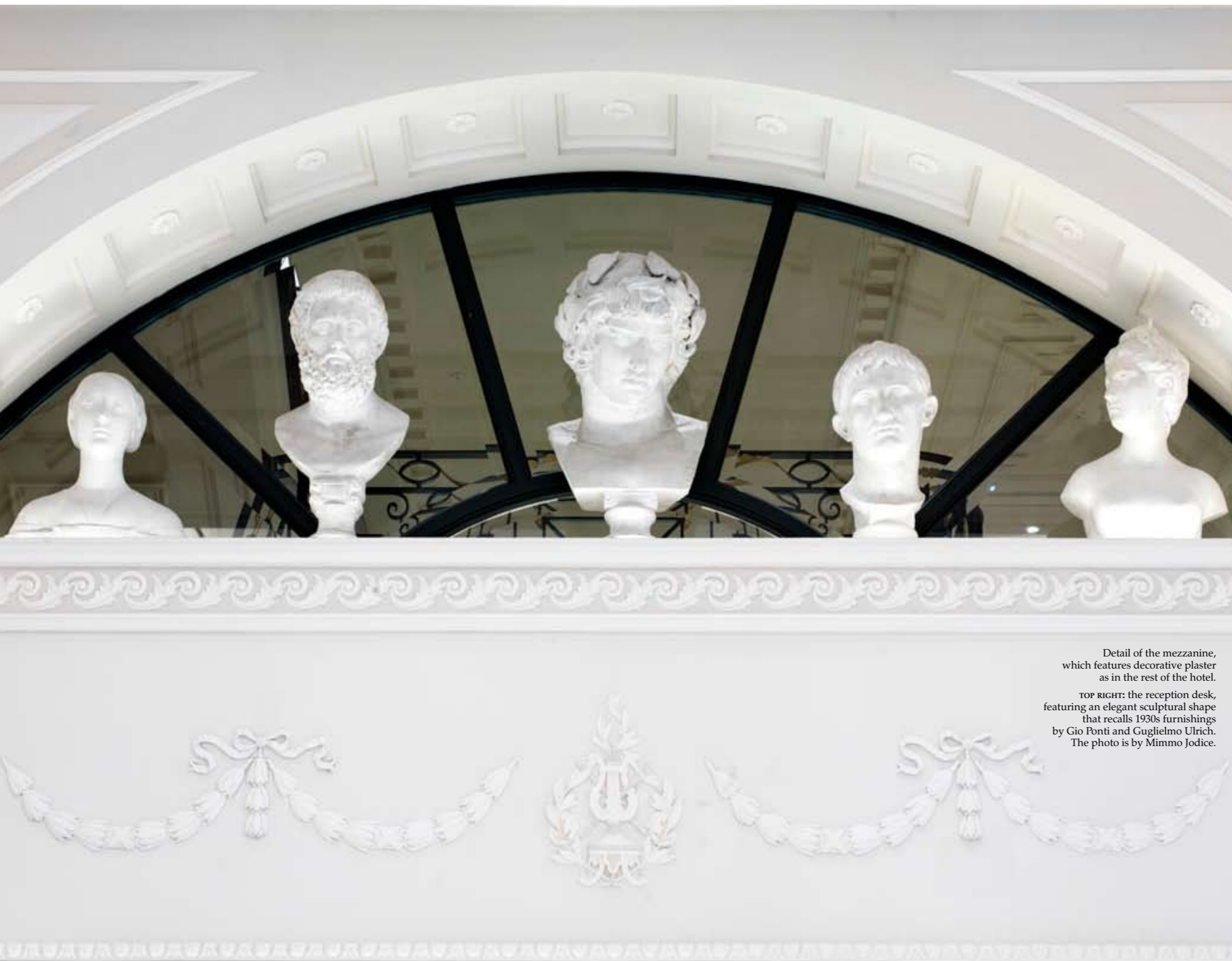
Detail of the mezzanine, which features decorative plaster as in the rest of the hotel.