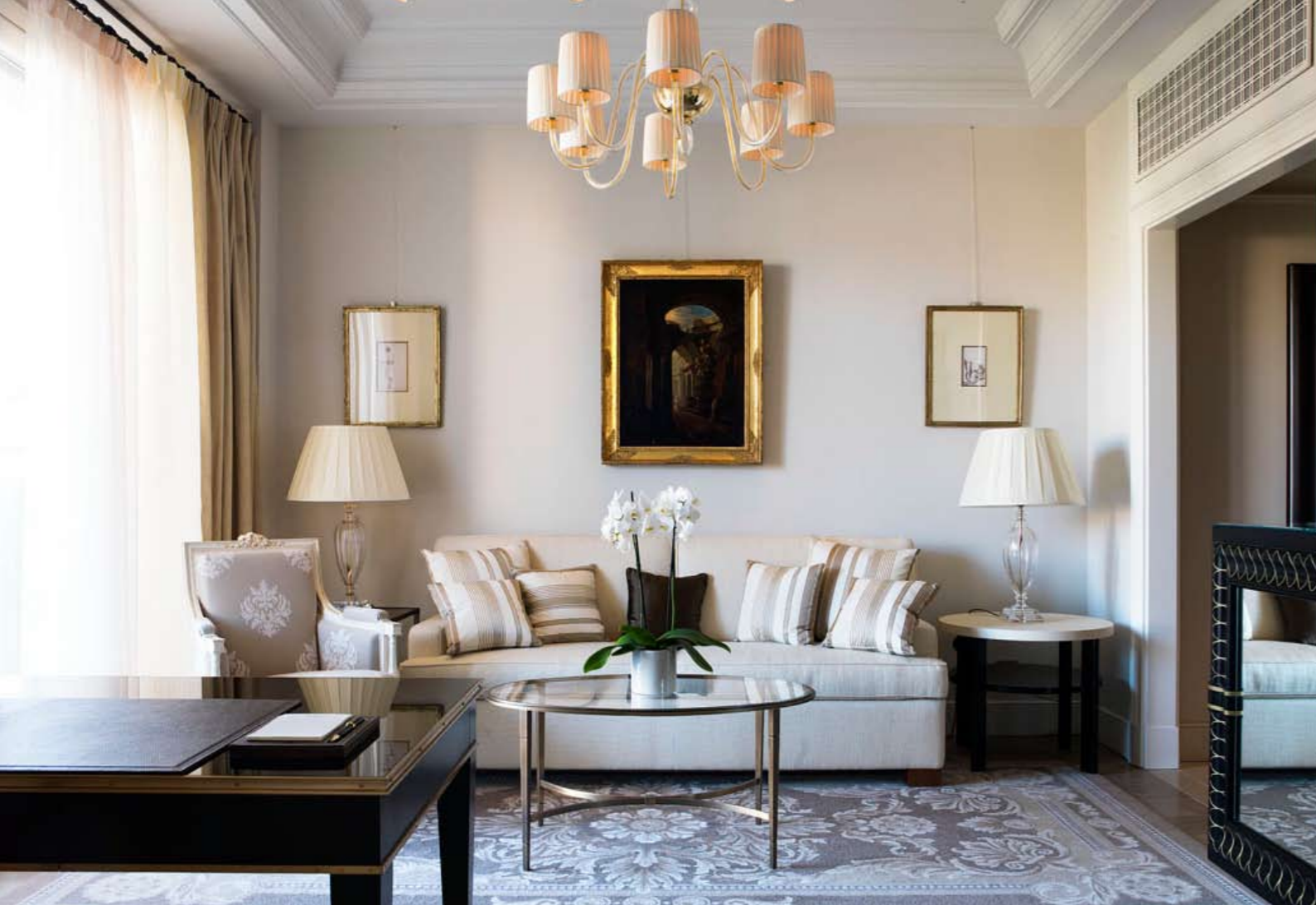
ABOVE: a "Parigi"-style room. These rooms have a classic feel with oak parquet flooring. The rug was designed by Studio Rochon in Paris.